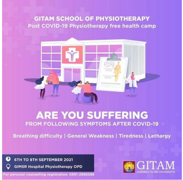
Research activities of GIMSR