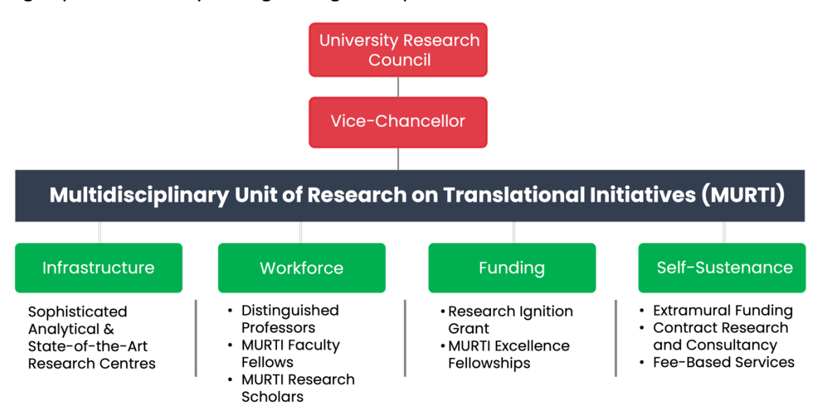
Figure 1: Framework of MURTI

To achieve this, MURTI centres will be set up across all campuses of GITAM University. These centres will involve top-quality faculty from diverse disciplines, either from GITAM's talent pool or invited from established national/global institutions, who will be associated with MURTI. By bringing together researchers from various fields onto a common platform, MURTI aims to create an intellectually stimulating research environment, breaking away from the traditional approach of looking at problems solely through a single discipline.